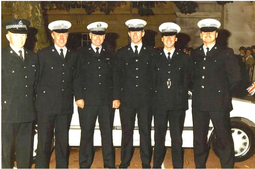
OFFICERS AT WESTERN TRAFFIC SECTOR