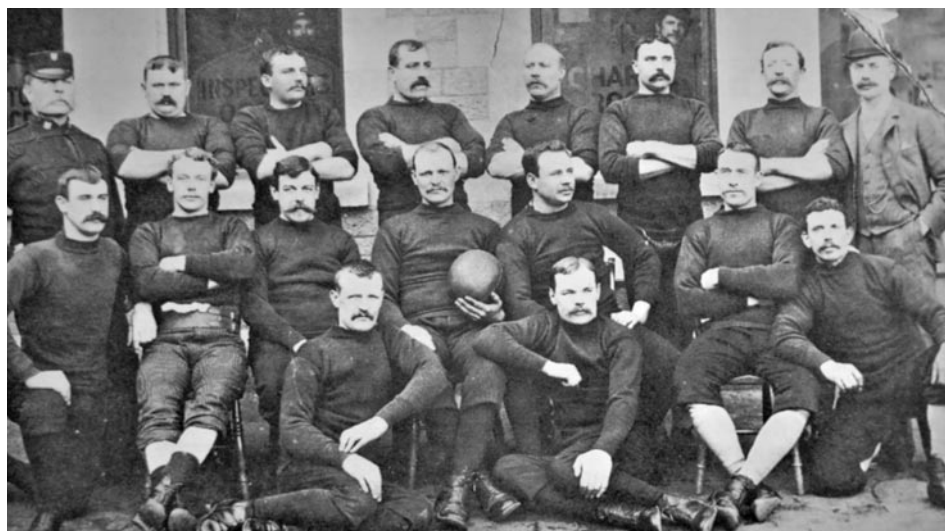
The first Swansea Police rugby team versus Swansea Butchers, 1891.