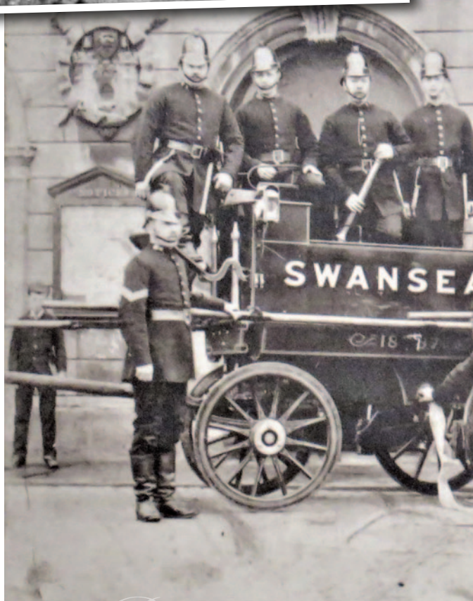
Swansea Police Fire Brigade, 1888.