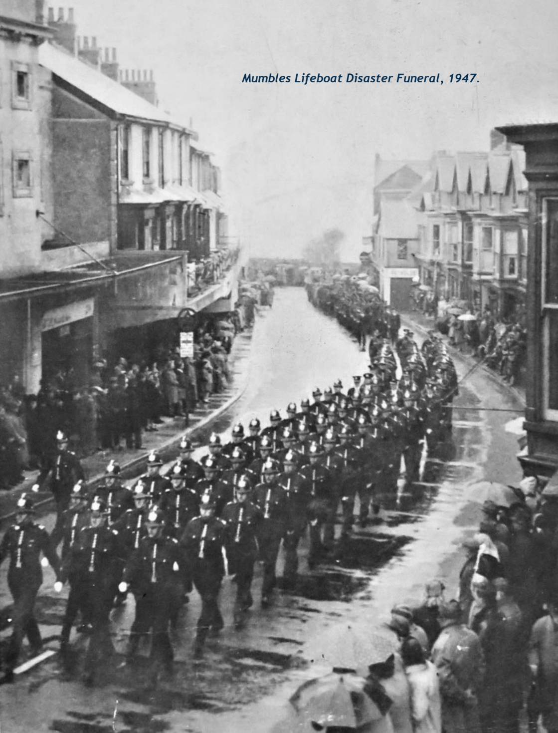
Mumbles Lifeboat Disaster Funeral, 1947.