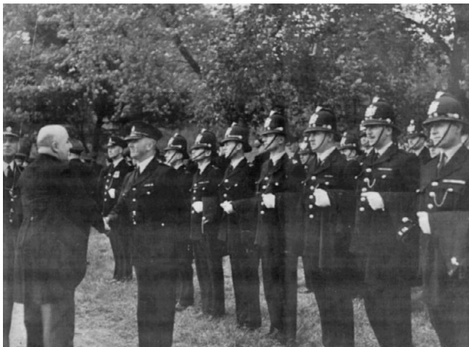
Swansea Police parading for the Queen's Coronation, 1953.