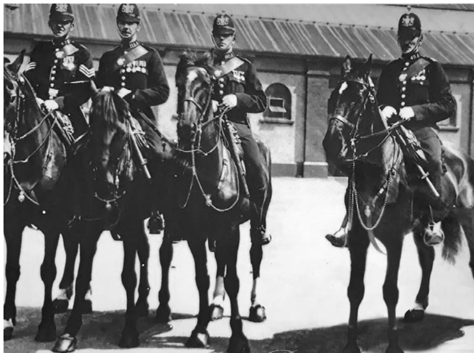
Mounted Officers, 1930's.