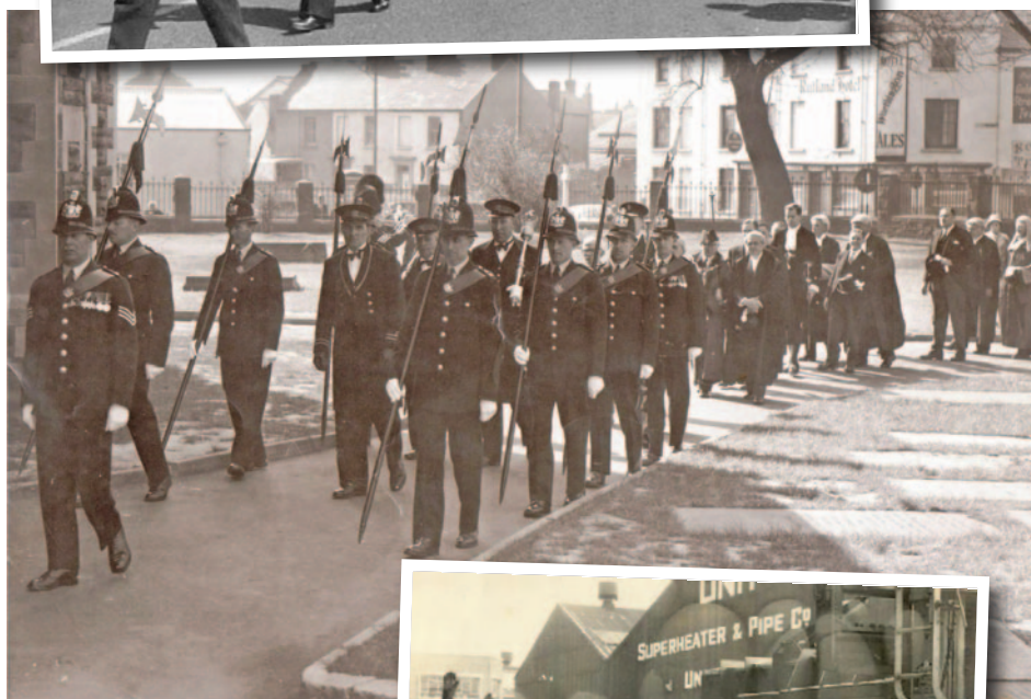
Swansea Police Halberdiers, 1961.