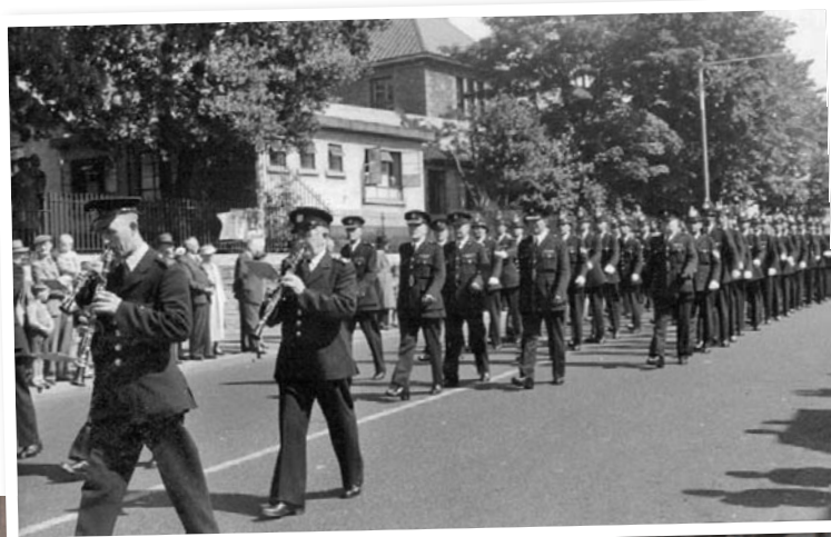
Mayor's Parade, 1960.