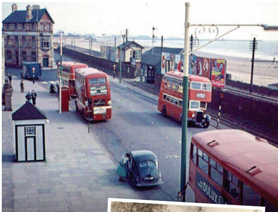
Police box, Oystermouth Road, 1950's.