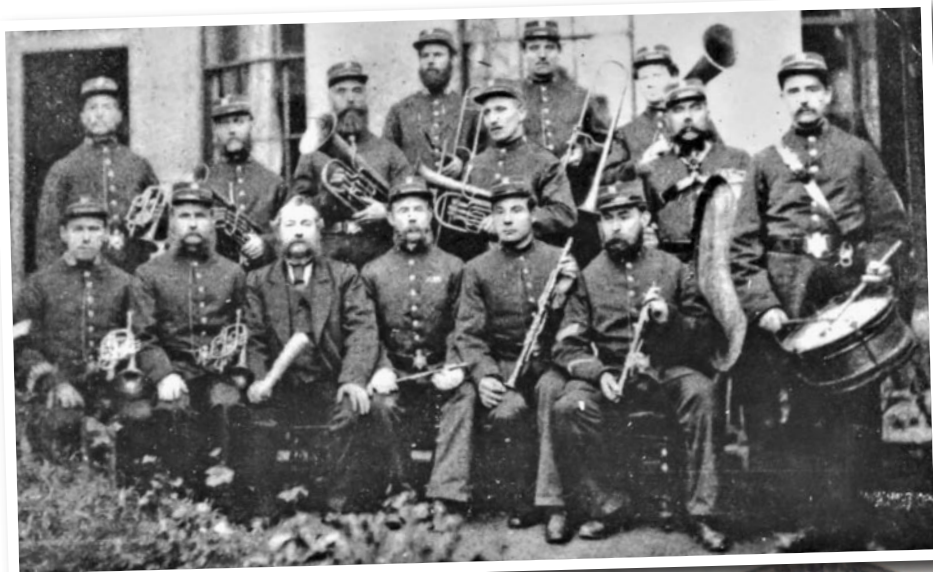
Swansea Police Band, 1879.