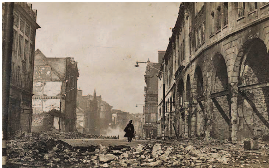
A lone police officer, Swansea 1941.