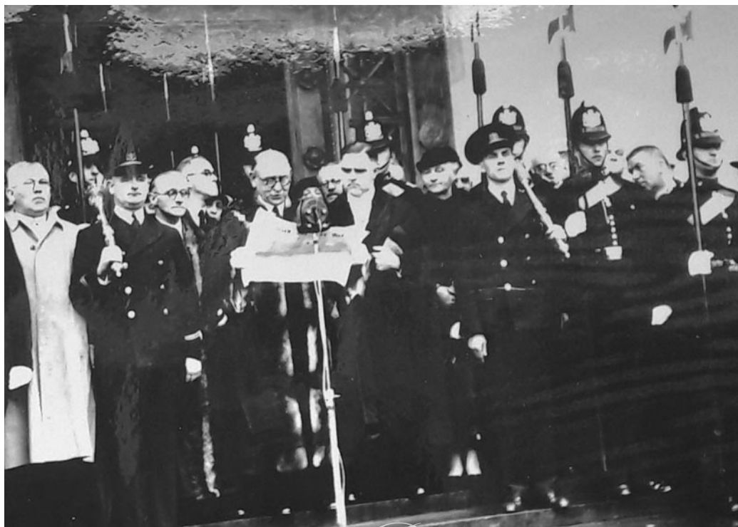
Proclamation of the abdication of King Edward VIII, Guildhall, 1936.