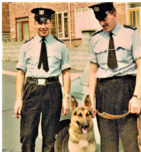
Dog Handler, 1969.