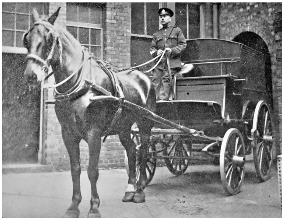
Prison Van, 1929.