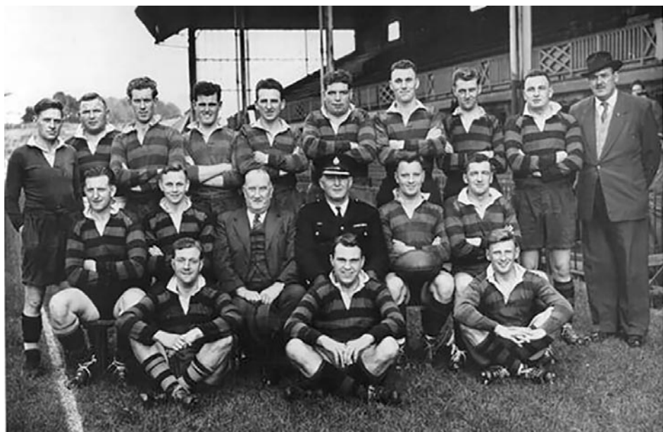
Swansea Police v Birmingham Police at St Helen's 1956/57 season.