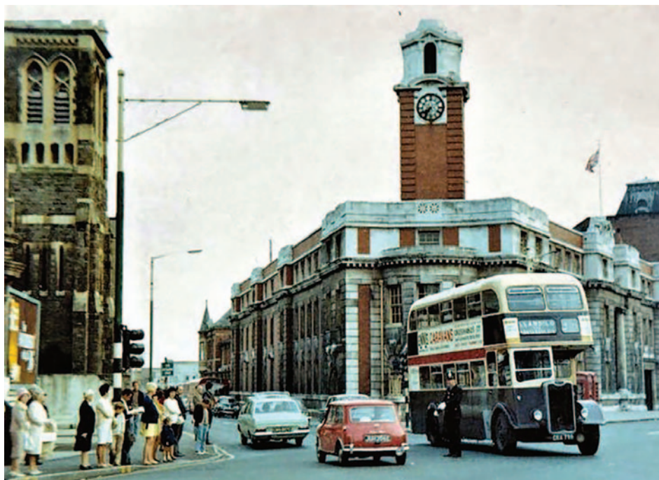
Central Police Station Swansea.