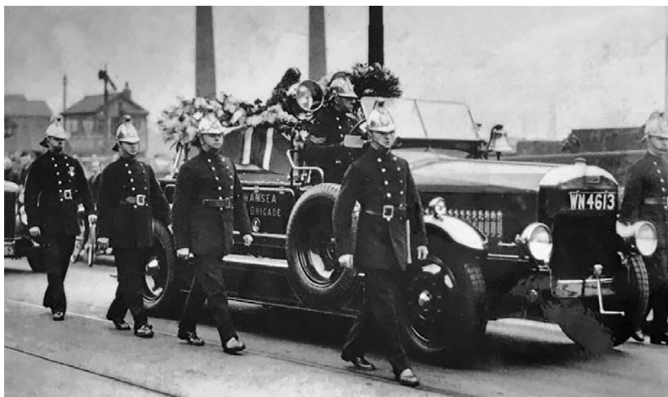
The funeral of PC Gethin Harris killed in a fire in 1932.