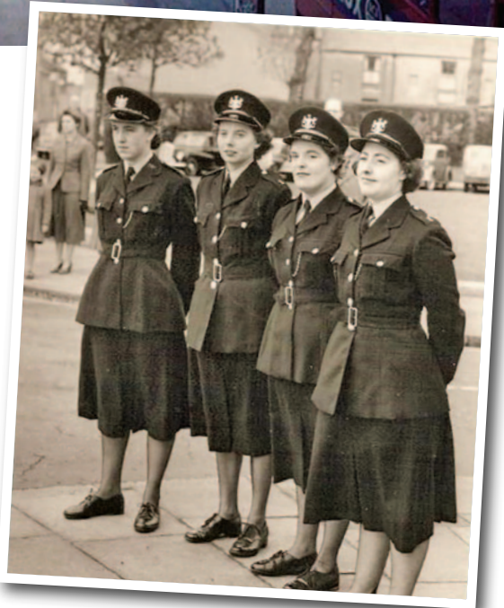
Women police officers, 1950's.