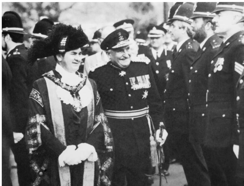
Parade in 1986 to mark the 150th anniversary of the formation of the Swansea Borough Police.