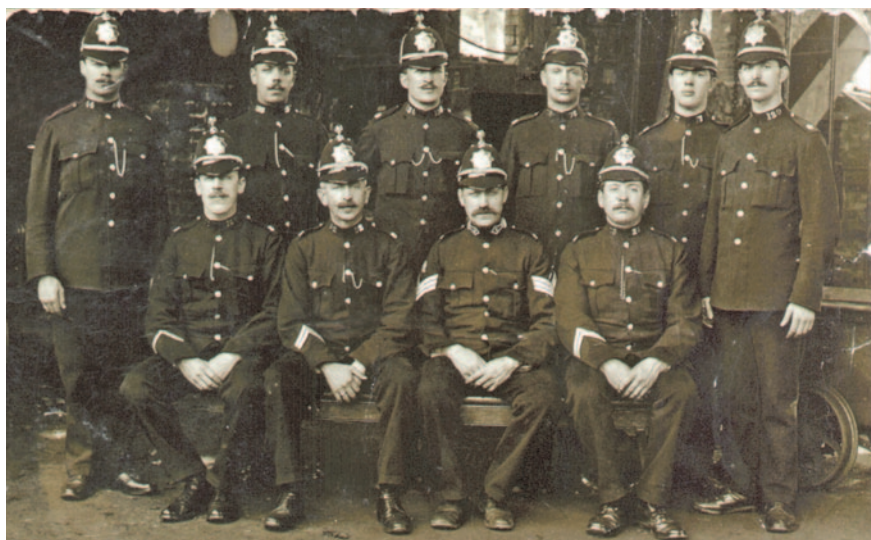
Swansea Police at the Tonypandy coal strike, 1911.