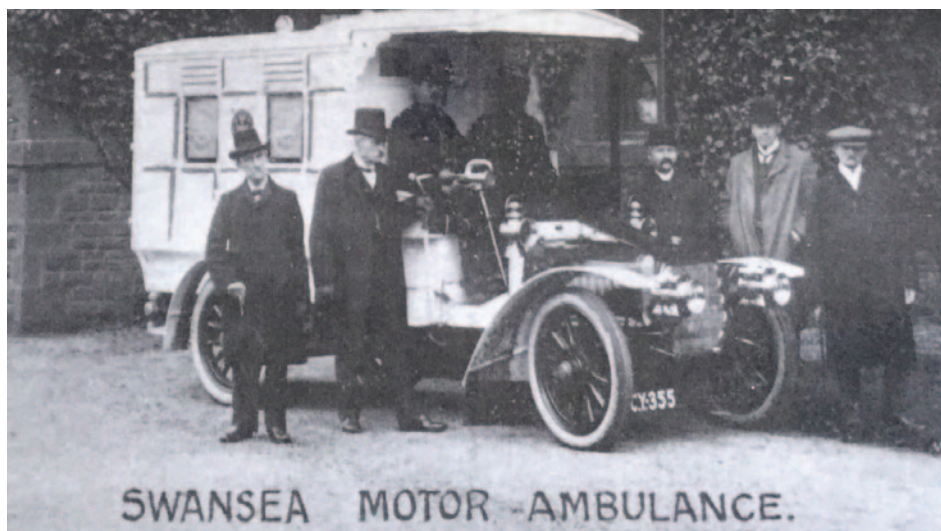
Swansea Police ambulance, 1908.