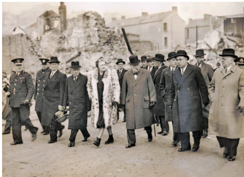
Visit by Prime Minister Churchill, 1941.